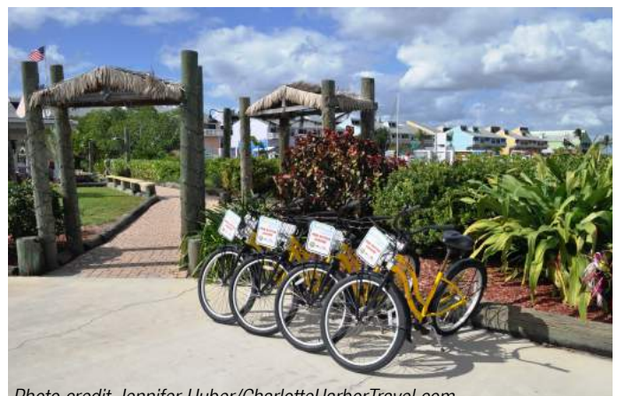
"Yellow Bike Loaner Program" at Fishermen's Village, Punta Gorda

With adoption of the 2040 LRTP, the CC-PG MPO has developed and adopted a long-term vision for transportation that supports and complements the major goals and objectives of Charlotte County. It will