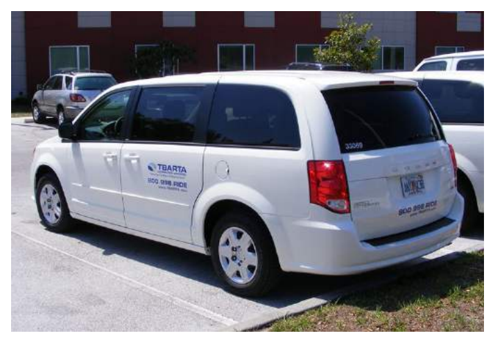
TBARTA Ridesharing Vanpool Service in West Central Florida

be important that the adopted plan be used by the MPO and the County as a guide for its annual and day-to-day transportation planning and programming activities and that the plan be flexible to respond to the ever changing environment in Charlotte County and the region.